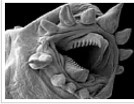
Shocking! Here's What Happened When We Tested The Top Probiotics