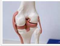
Surprisingly simple solution to help your joints. See why these ingredients are flying off shelves