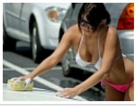
The 15 Most Beautiful Women in Sports