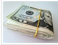
New Jersey Will hit stock explode? Can you turn $1,000 into $100,000?